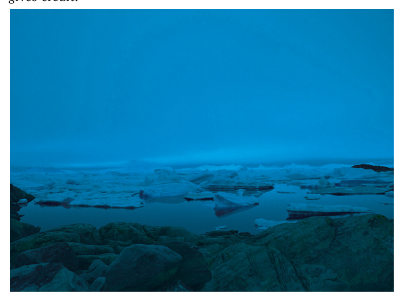
Ilulissat Icefjord, June 2019.